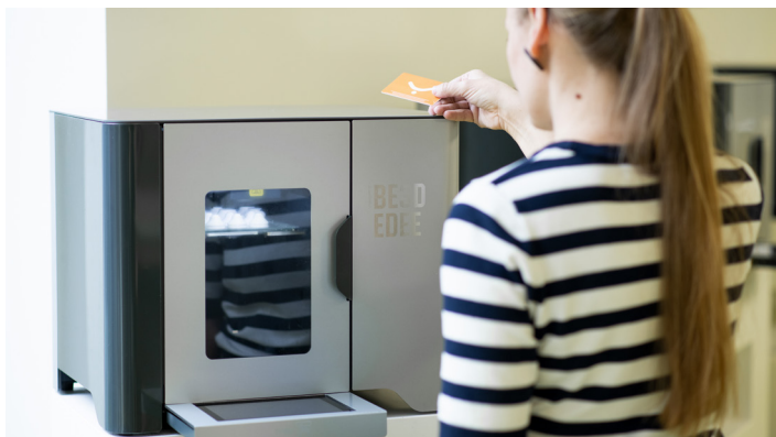
YSoft SAFEQ also offers 3D print management.