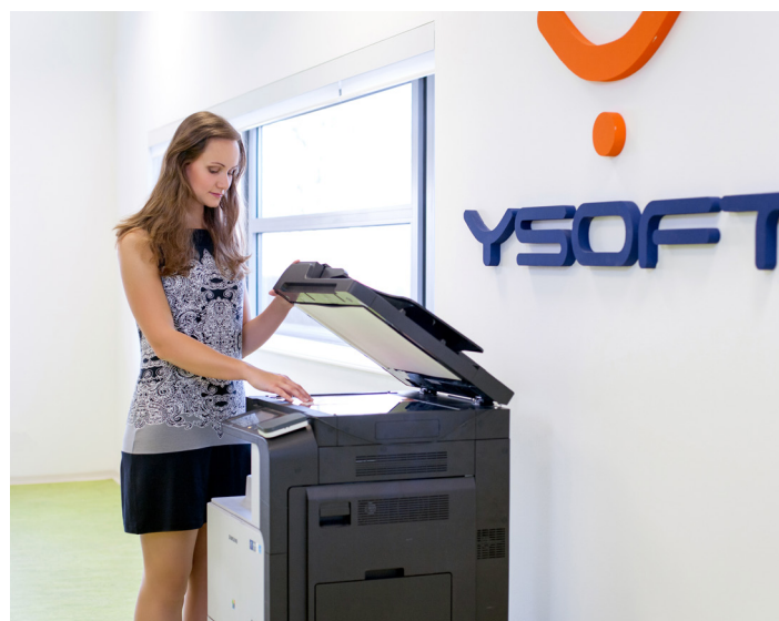
Automated scan workflows remove the complexity of scanning, processing and securely storing digital documents.

Choosing to outsource the work and integrate Mako from Global Graphics Software has allowed the engineers at Y Soft to focus on other priorities, such as delivering the company’s products faster and improving its customer support.