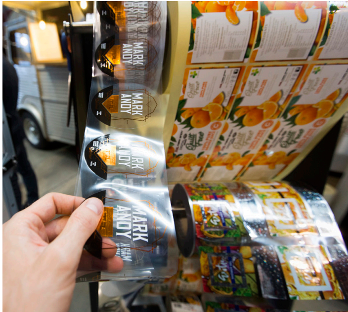
Fully variable printing: The Digital Series HD can print thousands of labels per minute, and each label can be different and at variable places on the web.

VDP jobs. As the Digital Series press was being developed, Mark Andy quickly realized that a highly capable RIP, hardware and software suite were required to process VDP jobs sufficiently fast to avoid press shut downs due to a lack of RIPped VDP work loaded on the digital press job queue.