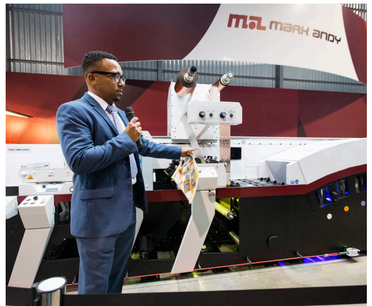
The Digital Series HD makes its debut appearance at Labelexpo 2018